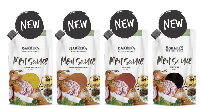
Available in convenient 1kg pouch with spout

Save time and energy with these versatile 'ready to go' meal sauces. Mix through cooked chicken, fish, beef, tofu, vegetables etc, heat and serve. See our recipe booklet or go to our website for more recipe ideas. (NOTE: We have optimised sodium and sugar levels per 100g).