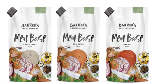
Available in convenient 1kg pouch with spout

NOTE: We have optimised sodium and sugar levels per 100g.