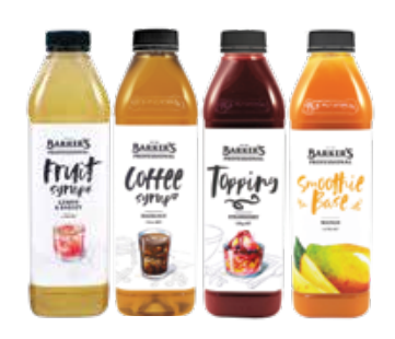
1LTR PLASTIC Crafted coffee, smoothie & fruit syrups & toppings.