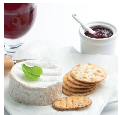
WITH CHEESE AND CRACKERS