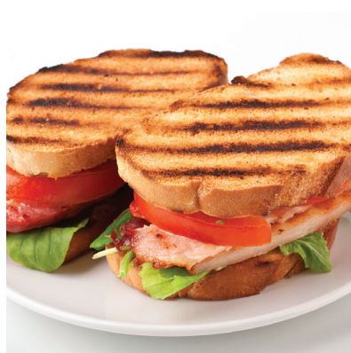
IN TOASTED SANDWICHES