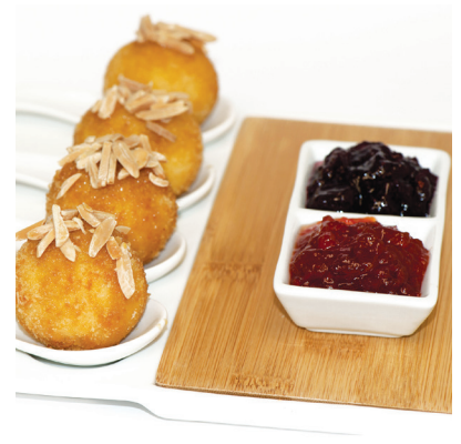
WITH DEEP FRIED GOATS CHEESE