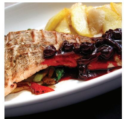
WITH MEAT OR FISH