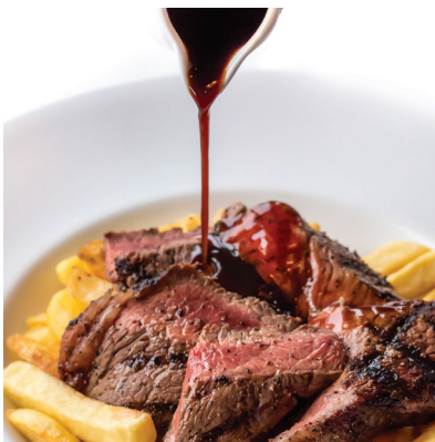
JUS OR SAUCE