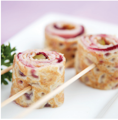
CRANBERRY & HAM ROLL UPS